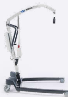
Birdie EVO PLUS

A smaller size allows the Birdie EVO COMPACT to easily operate in environments where space is limited.