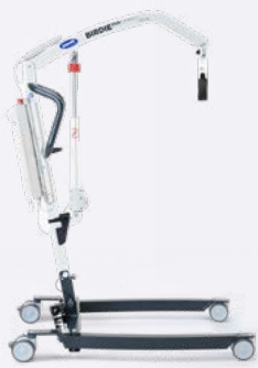
Birdie EVO COMPACT

A redesigned version of the market leading Birdie mobile floor lifter, designed to support safe transfers in both home-care and long-term-care environments.