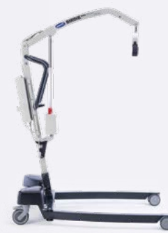
Birdie EVO XPLUS

Our premium model has an advanced control unit with service monitoring capabilities, protective covers and larger rear castors.